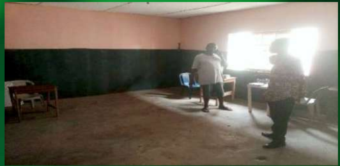
Classrooms for In-Class Training