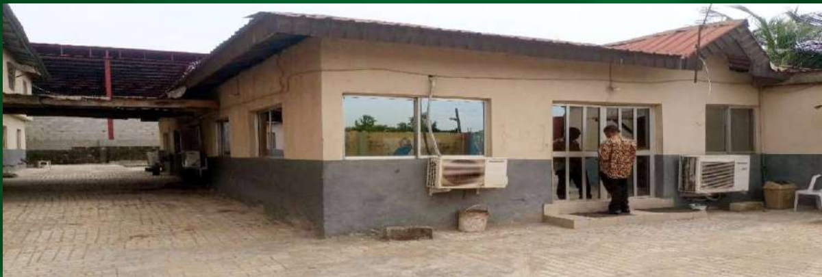
Open space for carpentry practical