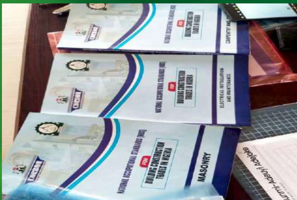
TRADES NATIONAL OCCUPATIONAL STANDARD