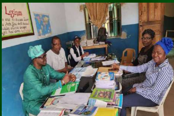
Meeting with quality assurance staff