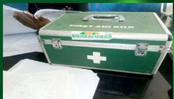
First Aid Box at the Centre.