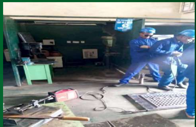
WELDING & FABRICATION WORKSHOP