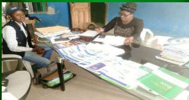
Interview with trainer