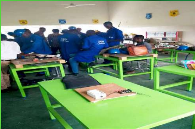
ELECTRICAL INSTALLATION WORKSHOP