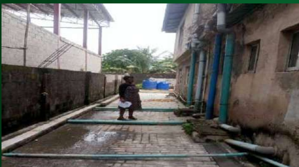
Open Space for Plumbing & pipefitting practical