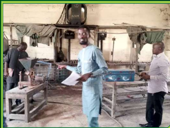
DISCUSSION DURING THE ASSESSMENT & EXAMINATION OF THE CENTER FACILITIES PICTURE SHOWING CENTRE HEAD LEADING