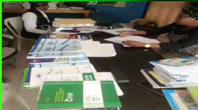
Training Documents at the Centre