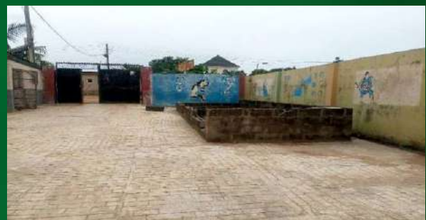
Open space for masonry works